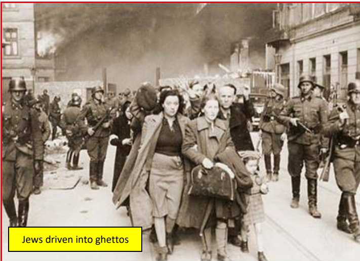
Jews driven into ghettos

When the time came for their transport to the death camps, they were driven like cattle into railroad cars. Hundreds were crammed into each railroad car. They were forced to stand up for most of the journey that in some cases took days. There was no water, very little food, and no bathroom facilities. Ventilation was poor. Many died on