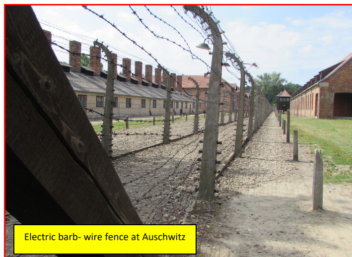
Electric barb- wire fence at Auschwitz

The entire camp was surrounded by an electrified bob wire fence. Sections of the camp were also isolated with the same kind of fence so that they could prevent a massive rebellion or attempt to escape. Guard towers were located along the perimeter of the fence. German guards were told to shoot any prisoner who tried to escape. Those who did kill prisoners trying to escape were rewarded with cigarettes, vodka, and attendance at parties.