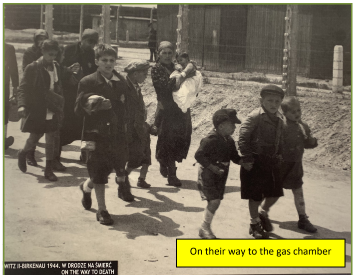
On their way to the gas chamber

After the deadly vapor had dissipated, some of the Jewish prisoners were forced to remove the dead bodies. Most of them were taken to the crematorium area. It was the goal of the Germans to cremate as many Jewish bodies as possible. At the height of the war, they were cremating an average of 4,756 bodies per day. Many other Jewish people were murdered and buried in massive graves just outside of the death camps. Tons of cremation ashes were dumped into the rivers and ponds around the areas of Auschwitz and Birkenau.