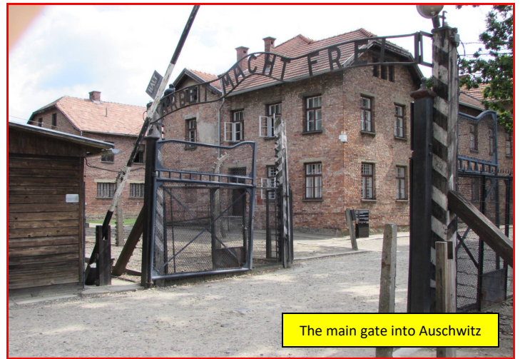
The main gate into Auschwitz

did escape were usually tracked down by dogs and returned to the camp where they were hung in the presence of their fellow prisoners at roll call the next morning.